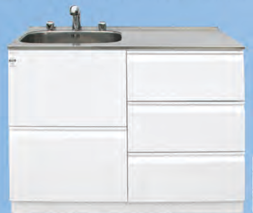
PLC1120K DISSCO 40 mm pull out spray mixer and LH basin PLC1120RHK DISSCO 40 mm pull out spray mixer and RH basin

More practical bench space than any other tub complemented by large storage drawers combined with a satin bench top that can be user resurfaced to near new when the wear and tear gets too much. Three mixer options to choose from. Under mounted pressed stainless steel tub. Four 450 mm deep drawers. Top mounted 1/4 turn washing machine taps. 1120 mm wide x 910 mm high x 560 mm deep.