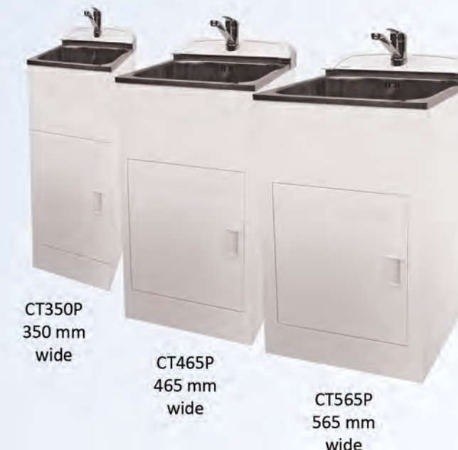
CT350P 350 mm wide

Concealed washing machine isolator valves. All pressure 40 mm mixer tap WELS 6 ★ low pressure 4 ★ mains Pressed stainless steel tub, reversible door, child-proof safety catch, 910 mm high, in three widths: