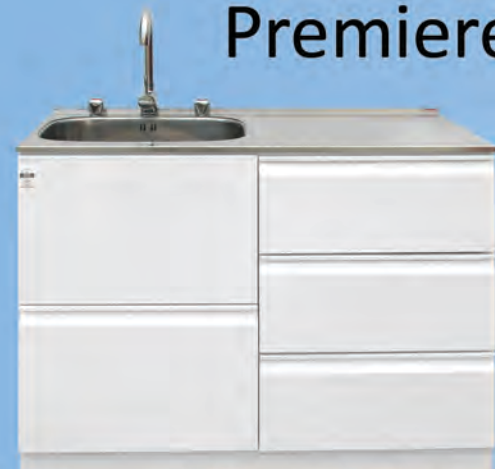
PLC1120G DISSCO gooseneck mixer and LH basin PLC1120RHG DISSCO gooseneck mixer and RH basin