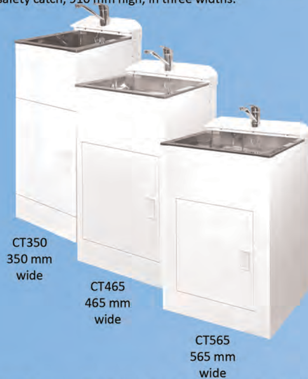
CT350 350 mm wide

Concealed washing machine isolator valves. All pressure 40 mm mixer tap WELS 6 ★ low pressure 4 ★ mains fabricated stainless steel tub, reversible door, child-proof safety catch, 910 mm high, in three widths: