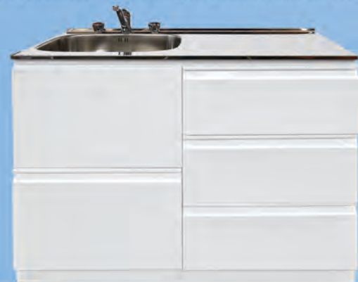
PLC1120 DISSCO Std. 40 mm kitchen mixer and LH basin PLC1120RH DISSCO Std. 40 mm kitchen mixer and RH basin