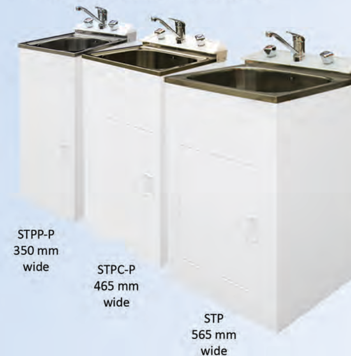
STPP-P 350 mm wide

Top mounted 1/4 turn washing machine taps. All pressure 40 mm mixer tap WELS 6 ★ low pressure 4 ★ mains Pressed stainless steel tub, reversible door, child-proof safety catch, 910 mm high, in three widths: