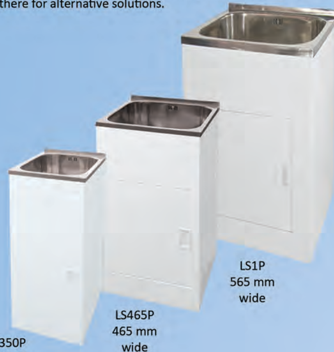
LS350P 350 mm wide

Our LS range is the best choice for a laundry upgrade when it's not justifiable changing the original taps in your laundry wall. Featuring seamless laundry tubs complete with overflow on a powder coated galvanised steel cabinet with reversible door, child proof safety catch and moveable shelf. The LS1P also includes a washing machine bypass and although the 2 smaller units don't, the knock outs are still there for alternative solutions.